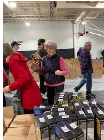
Many hands make for light and joy-filled work.