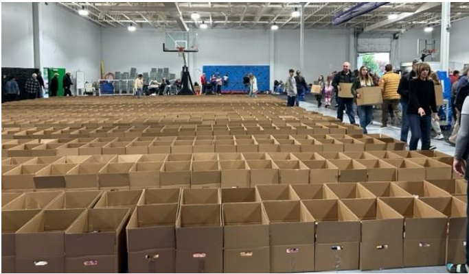
Just some of the boxes waiting to be filled